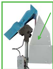
Wind Guard Kit - Universal