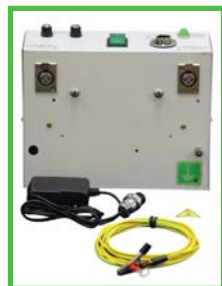
Battery Conversion Kit