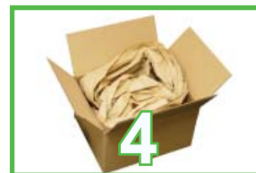
4 For top and side void fill