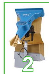
2 Run through patented converters