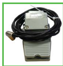
Dual Footswitch Kit