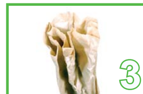
3 Generate PaperStar ™ void fill